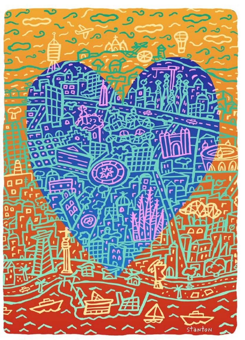
10è Aniversari del Barcelona International Community Day